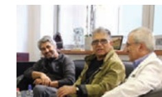
Deepak Chopra visited Hadassah’s hospitals to discuss possible joint project on quantum biology

“I believe in the work you do, one person at a time, building this wonderful place. I urge everyone to do whatever they can do to help Hadassah.”