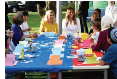
First Ladies Melania Trump and Sara Netanyahu meet with Hadassah physicians, nurses and pediatric patients in 2017