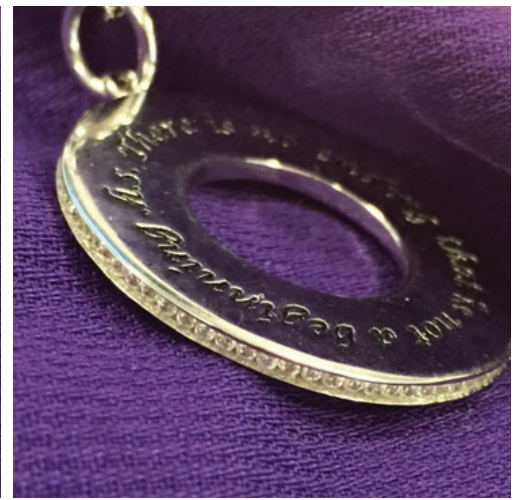
Photo enlarged to show detail.

For a gift of $150* in support of groundbreaking medical research at Hadassah Medical Organization, you can receive this lovely sterling silver necklace edged with cubic zirconias. It is inscribed with the famous quote from Hadassah's founder, Henrietta Szold, “There is no ending that is not a beginning.”